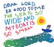
Children's Defense Fund CALIFORNIA